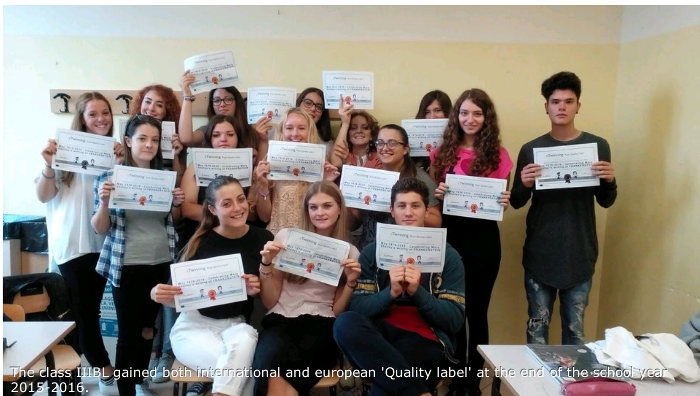
The class IIIBL gained both international and european 'Quality label' at the end of the school year 2015-2016.

Our school elaborated three projects and it won two prizes.