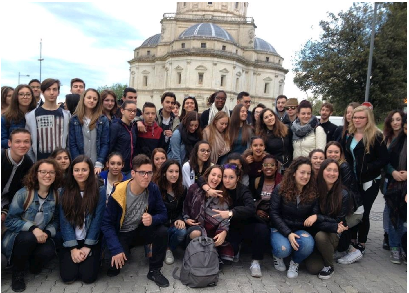
Students from IIIAL and IIIBL that hosted French students during the school year 2015-2016.