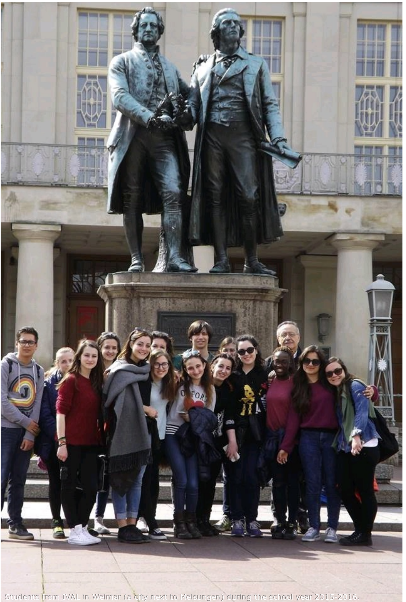
Students from IVAL in Weimar (a city next to Melsungen) during the school year 2015-2016.