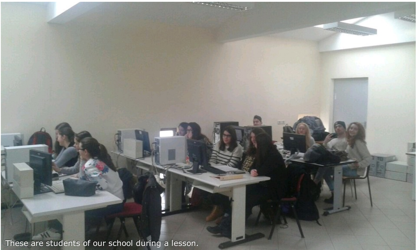
These are students of our school during a lesson.