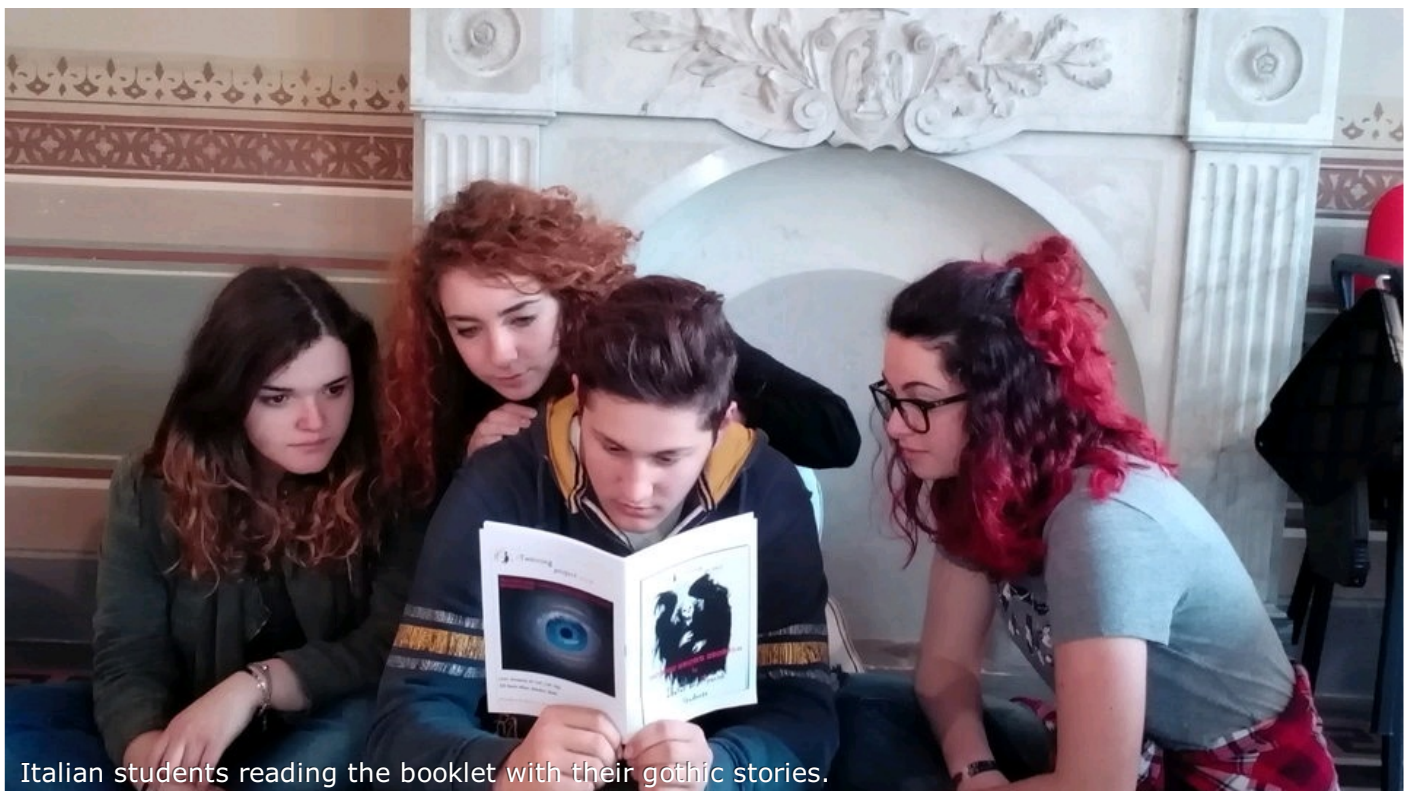
Italian students reading the booklet with their gothic stories.