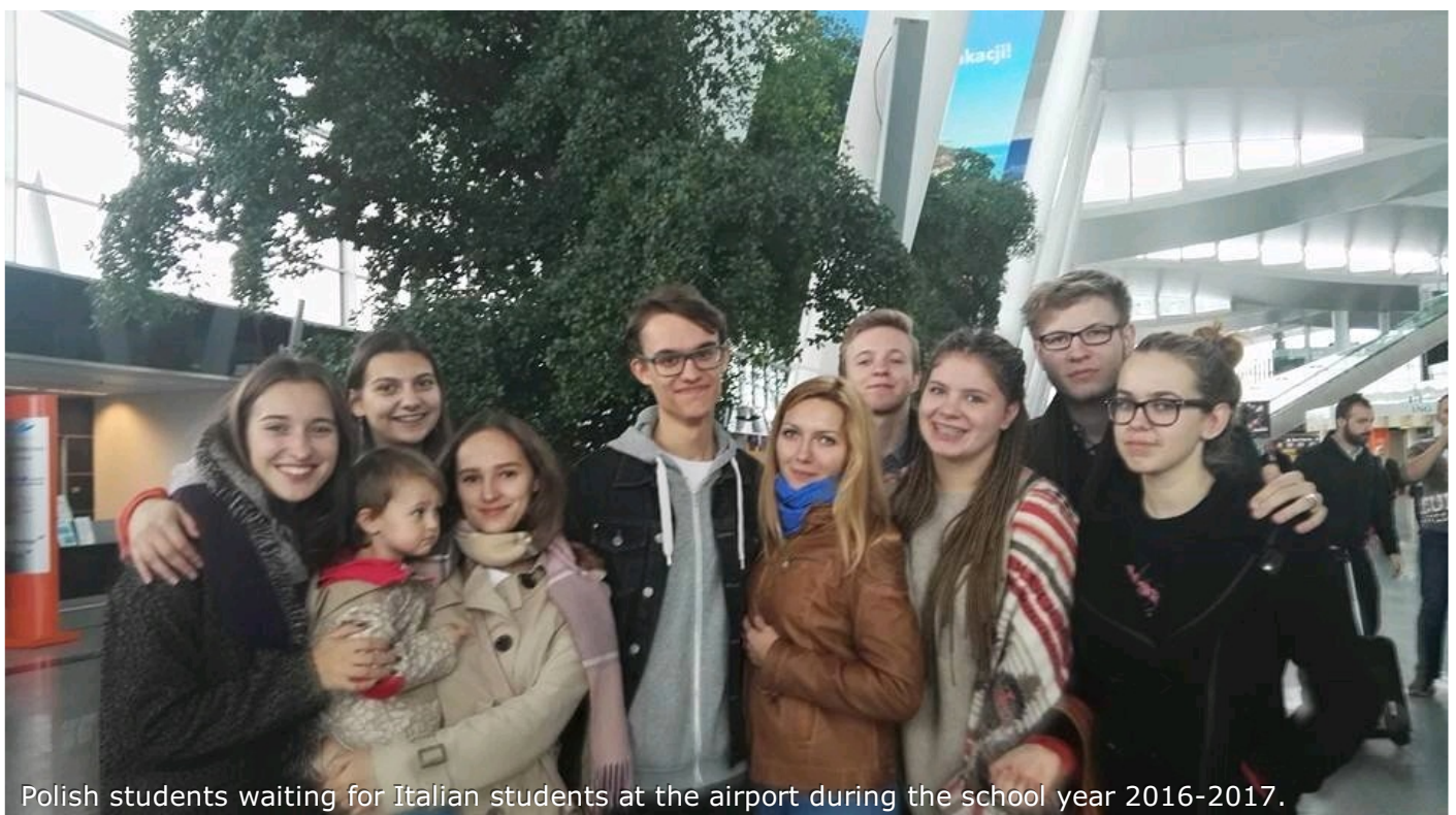
Polish students waiting for Italian students at the airport during the school year 2016-2017.

Wrocław is the largest city in western Poland. It is the historical capital of Silesia and Lower Silesia. Today, it is the capital of the Lower Silesian Voivodeship.