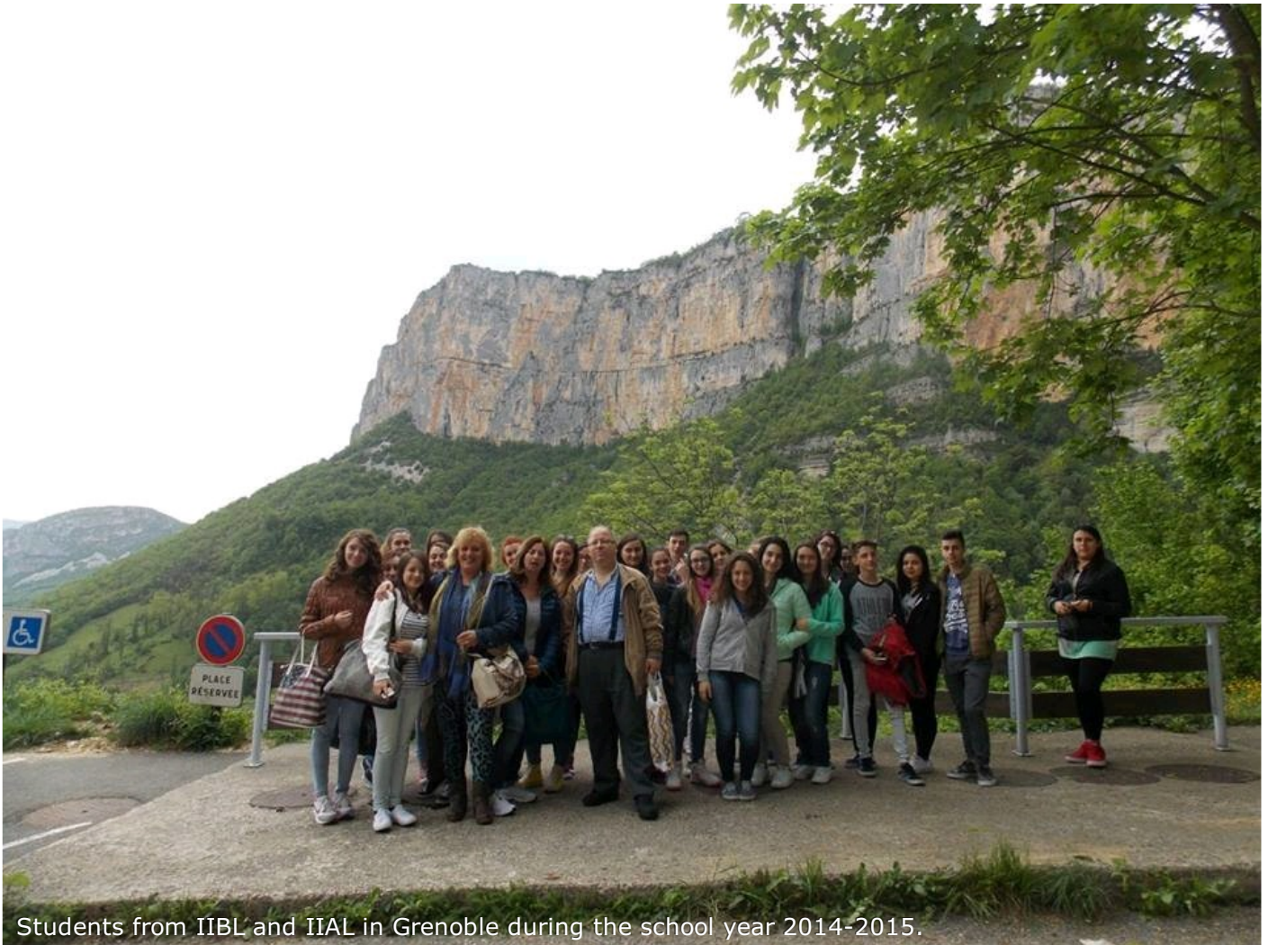
Students from IIBL and IIAL in Grenoble during the school year 2014-2015.

The school we are twinned with is the 'Cité Scolaire Stendhal di Grenoble'.