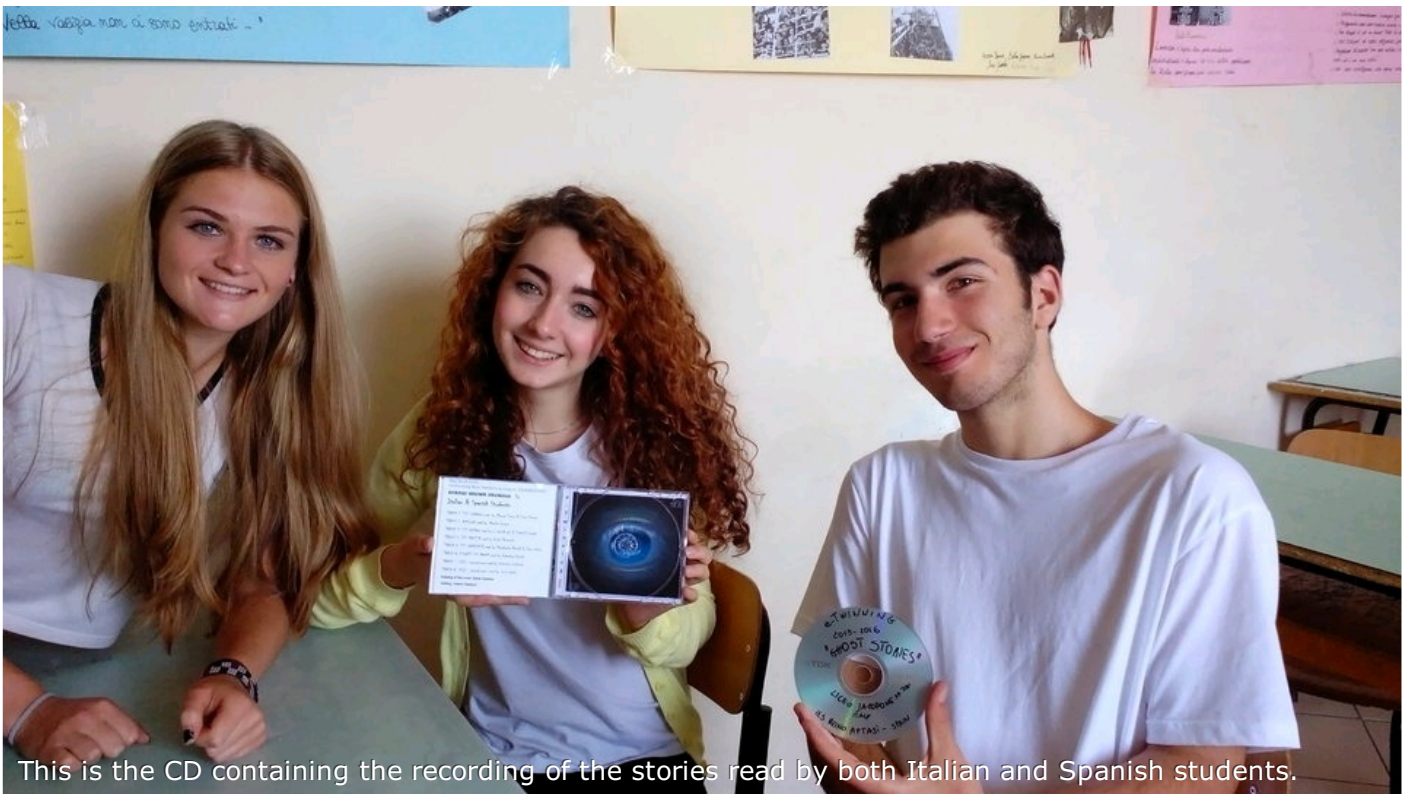
This is the CD containing the recording of the stories read by both Italian and Spanish students.

Here below there are some of the stories read by both Italian and Spanish students.